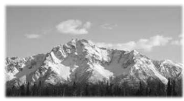
May 25, 2025

Mission of Valley church of Christ ...Make Disciples...Matthew 28:19